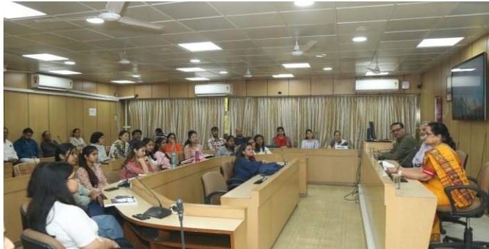
NIEPA Scholars Interaction Programme