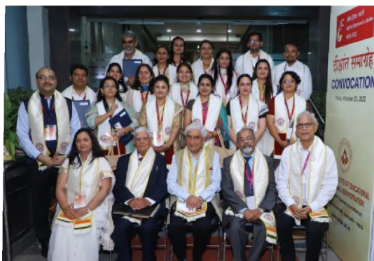
Convocation October 21, 2022

The scholars registered for the Ph.D. Programme will work on an approved topic and submit the thesis under the allocated supervisor. In accordance with the UGC guidelines each scholar will be assigned a Research Advisory Committee (RAC) consisting of internal and external experts. The RAC will provide regular guidance to the doctoral candidates. In addition, teaching programs at the NIEPA will provide inputs on Research Methodology and Ethics, conceptual and thematic inputs.